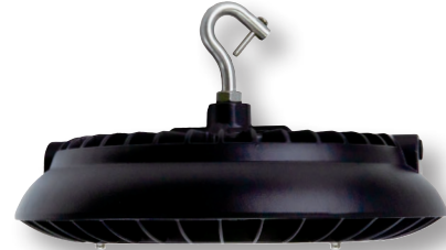
LED Round High Bay

Input Line Voltage ..... 120-277VAC or 347/480VAC Input Line Frequency (Hz) ..... 50/60Hz Wattage (W)..... 80W/100W/150W/200W Lumens (l)..... 13200L/16500L/24750L/33000L Lumens per Watt (LPW)..... >165 LPW Rated Life..... 50,000 hours Minimum Starting Temperature ..... -40°C (-22°F) Maximum Operating Temperature..... 50°C (122°F) CRI ..... >80 Power Factor ..... >0.95 THD..... <20% Surge Protection ..... 4kV Ratings ..... cULus wet location rated, IP65, DLC 5.1 Premium Controls..... 0-10V dimming (standard)