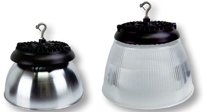
LED Round High Bay with aluminum reflector